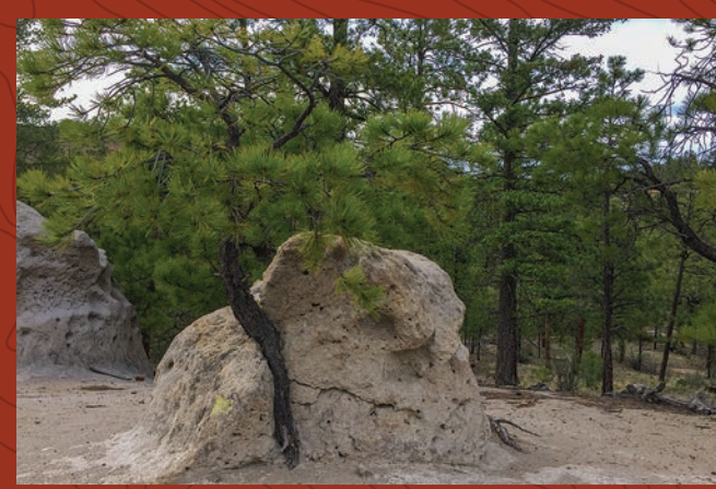
DESERT ENVIRONMENTS CAN BE HARSH

A 58-mile network of trails links the foothills, canyons, and mesas in and around Los Alamos. Hikers, runners, horseback riders, mountain bikers, and other trail users delight in the variety of trails from which to choose. The trails offer a quick escape from the hectic pace in town; a route to commute to work, an easy stroll or a physical challenge, the chance to observe wildlife, or simply soaking in the impressive views. The County Trail Network connects over 100 miles of trails on the surrounding Santa Fe National Forest and the adjacent Valles Caldera National Preserve.