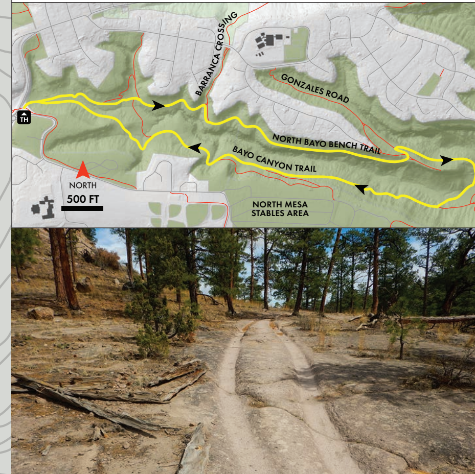
HIKE, BIKE, OR RUN IN THE WAGON RUTS ON THE NORTH BAYO BENCH TRA

Head downhill from the parking area, but don't go through the tunnel. Curl to the east across an open area, and then take the left fork, the North Bayo Bench Trail. This trail traverses along a bench about 50 feet below the mesa top. After about 1.5 miles, a short spur trail to the right heads to the Bayo Canyon overlook point. Visit the point or continue as the trail rounds the point of the mesa. In a few yards make a sharp right and angle down the north face of the mesa on a rutted old road. When the trail almost reaches the canyon bottom, take the left fork to avoid a sandy pitch. Cross the canyon bottom and pick up the Bayo Canyon Trail on the south side. Turn right and ascend this deeply incised trail to the south Bayo Bench. Stay on the bench for a mile back to the trailhead.