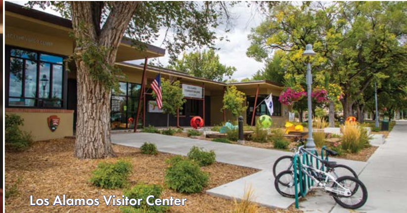
Los Alamos Visitor Center