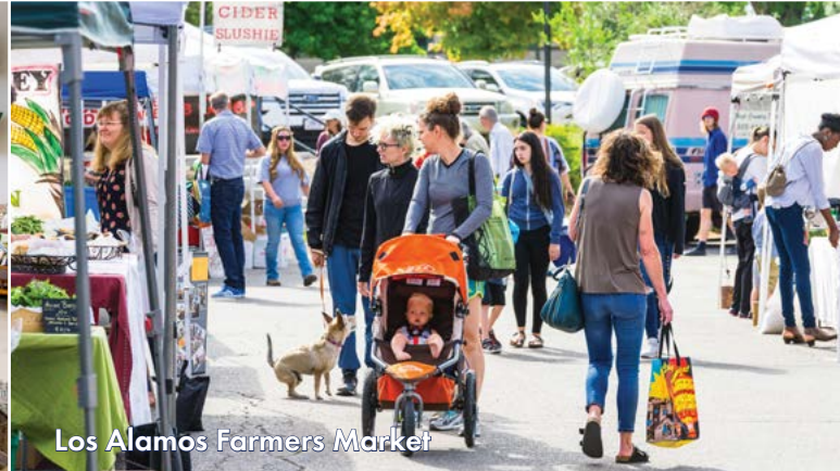
Los Alamos Farmers Market