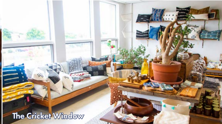
The Cricket Window