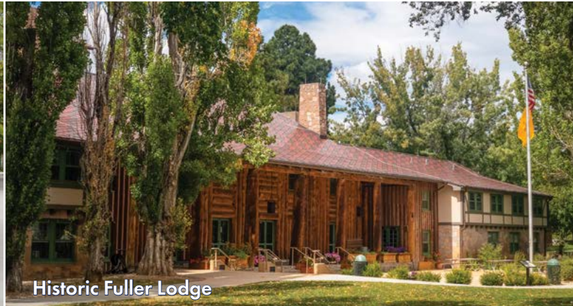
Historic Fuller Lodge