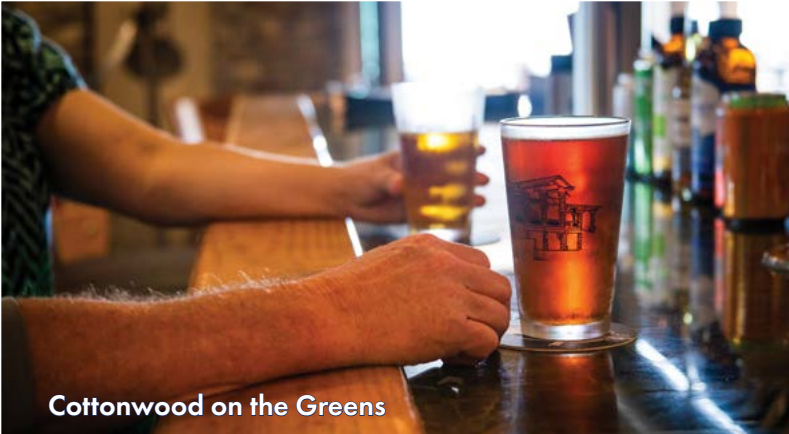
Cottonwood on the Greens