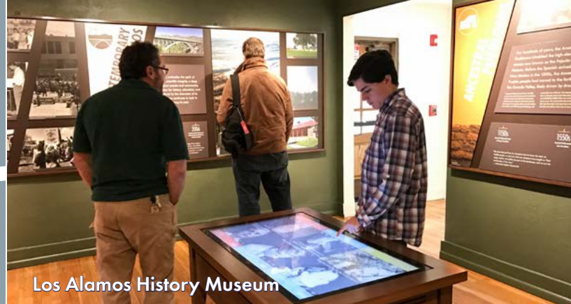
Los Alamos History Museum