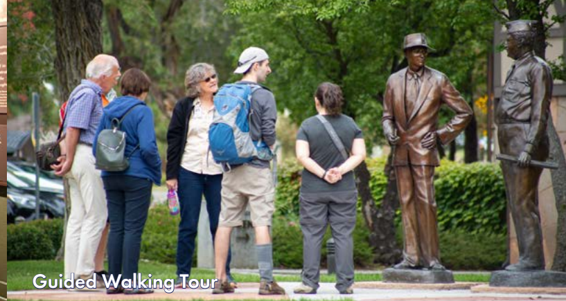
Guided Walking Tour