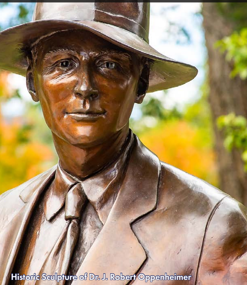
Historic Sculpture of Dr. J. Robert Oppenheimer

Once you've made the journey to Los Alamos, you can begin to understand how much the culture and the people are defined by this remote and beautiful landscape. While Los Alamos is known to many as the birthplace of the atomic bomb, the town's history dates back 1.6 million years with a different kind of energy—volcanic eruptions that created the Pajarito Plateau and the mesas and canyons where communities have settled for millennia: Ancestral Pueblo people, Homesteaders, Ranch School students, and thousands of scientists, soldiers, and engineers from all over the world who came to work on the Manhattan Project and stayed to create the Los Alamos community. Experience the dynamic history of this great place by visiting the museums, National Parks and other attractions profiled in this guide.