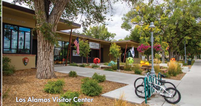
Los Alamos Visitor Center