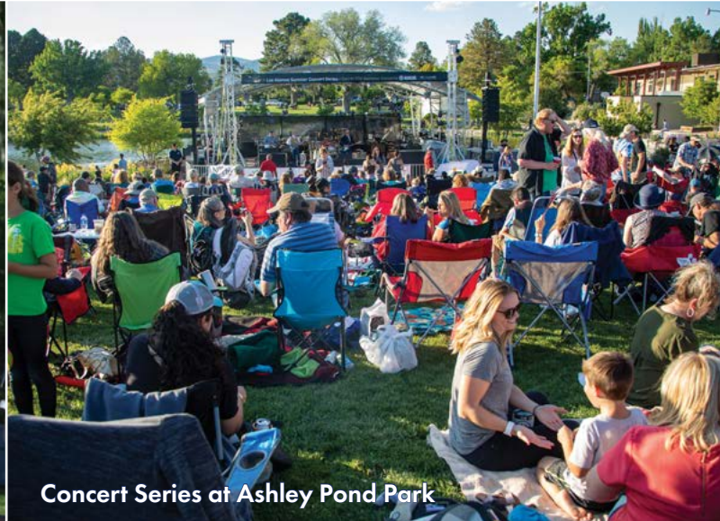
Concert Series at Ashley Pond Park