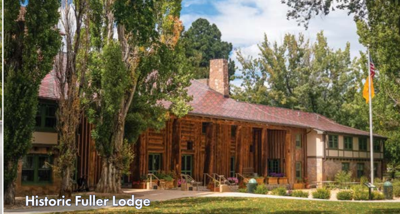
Historic Fuller Lodge