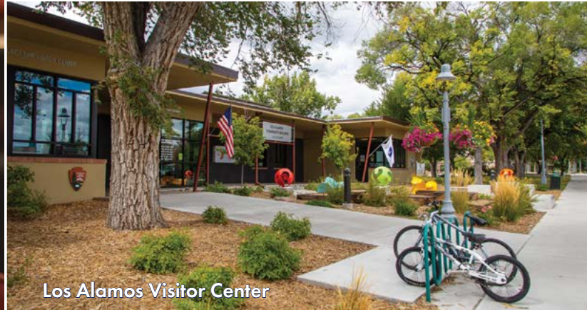
Los Alamos Visitor Center