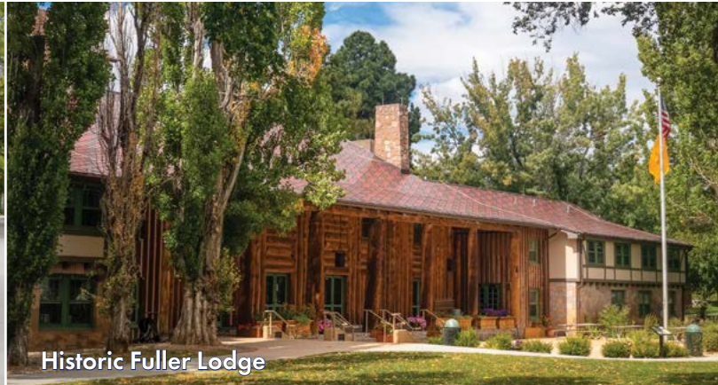
Historic Fuller Lodge