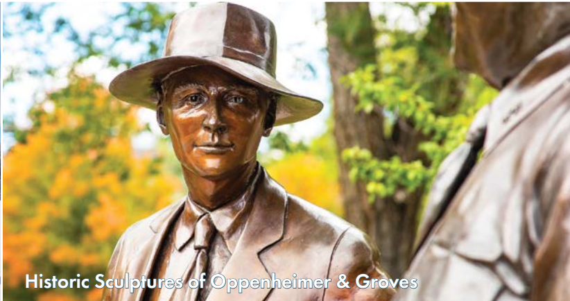
Historic Sculptures of Oppenheimer & Groves