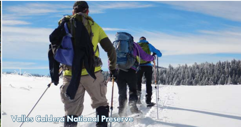
Valles Caldera National Preserve