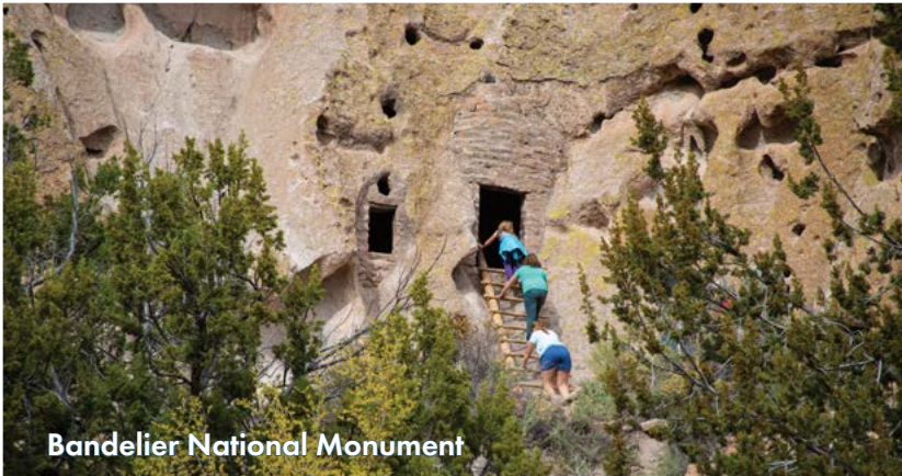
Bandelier National Monument