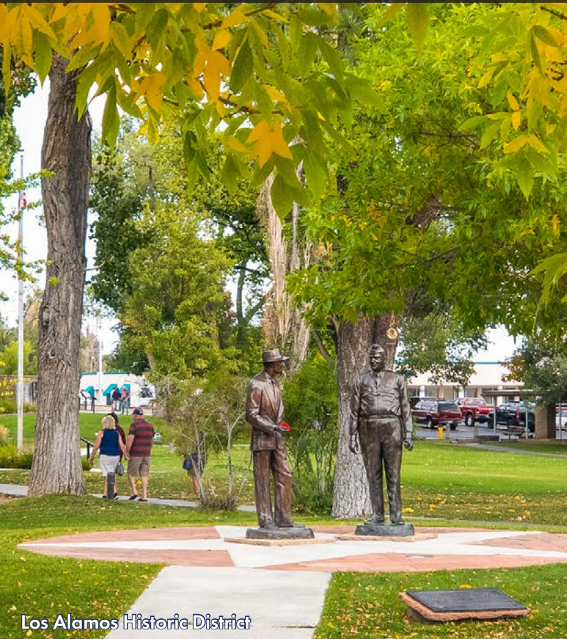
Los Alamos Historic District