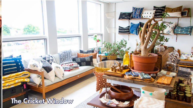
The Cricket Window