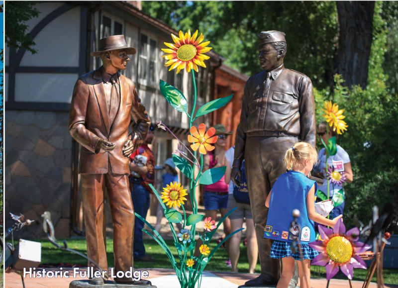
Historic Fuller Lodge