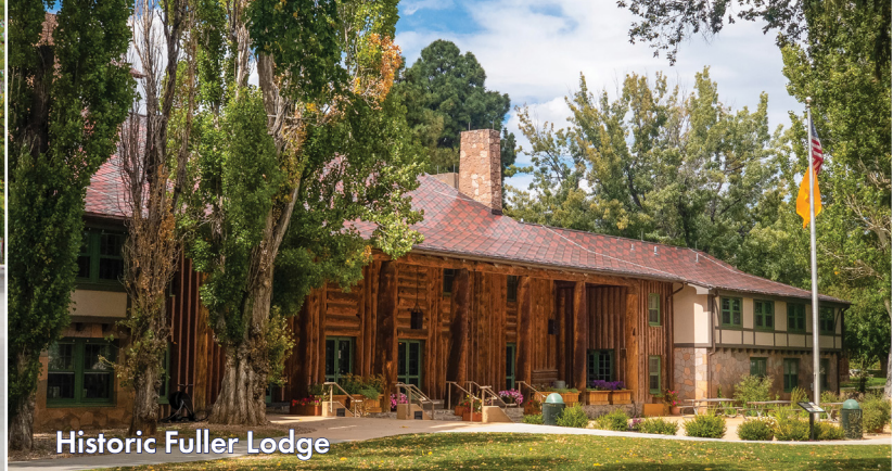
Historic Fuller Lodge