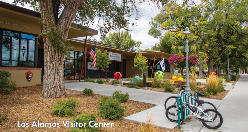
Los Alamos Visitor Center