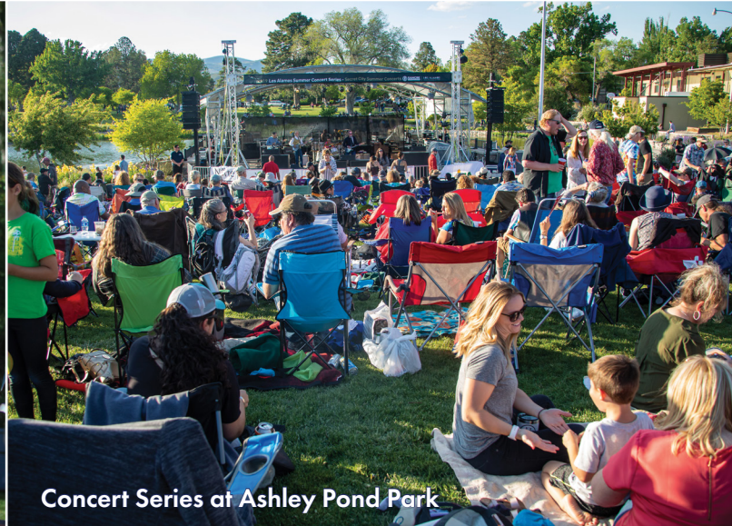
Concert Series at Ashley Pond Park