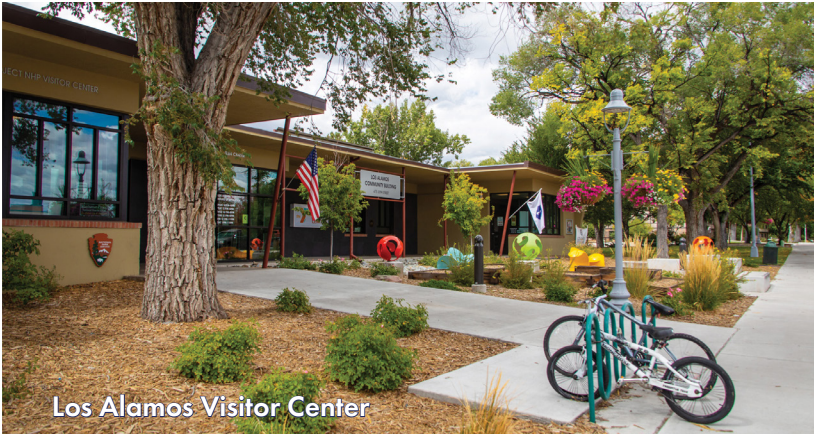
Los Alamos Visitor Center