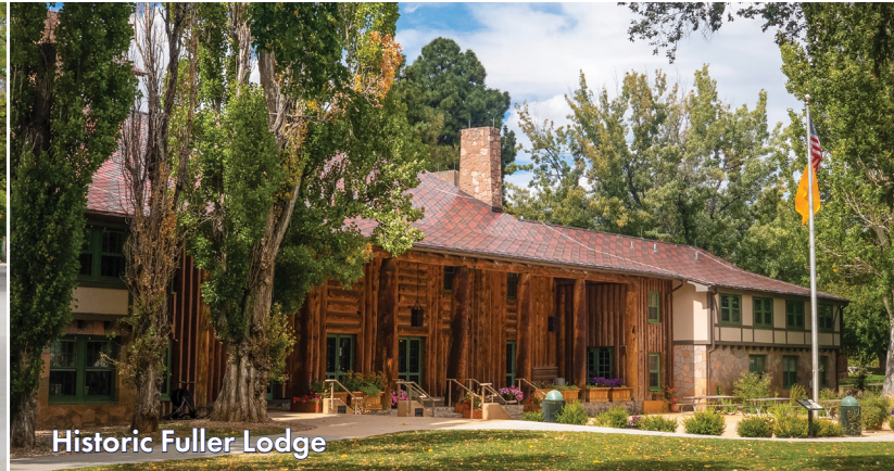
Historic Fuller Lodge