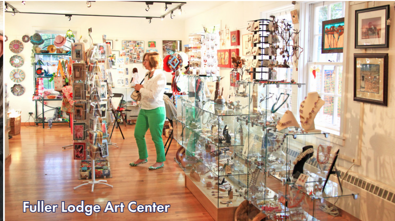
Fuller Lodge Art Center