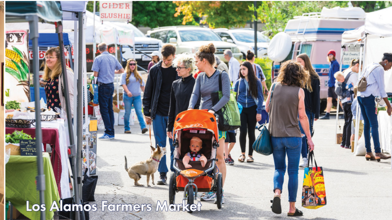
Los Alamos Farmers Market