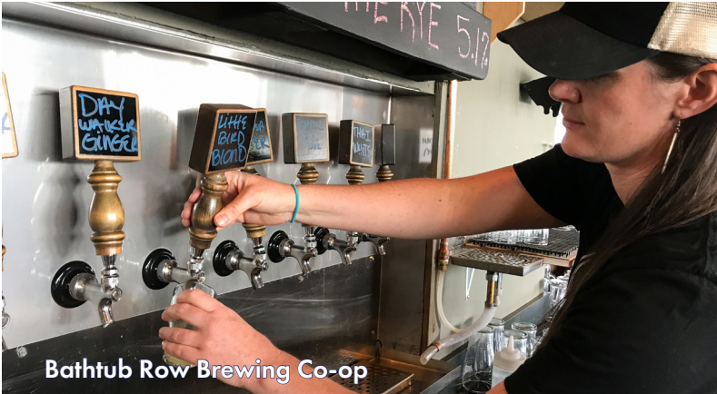
Bathtub Row Brewing Co-op