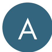
Arts &amp; Culture