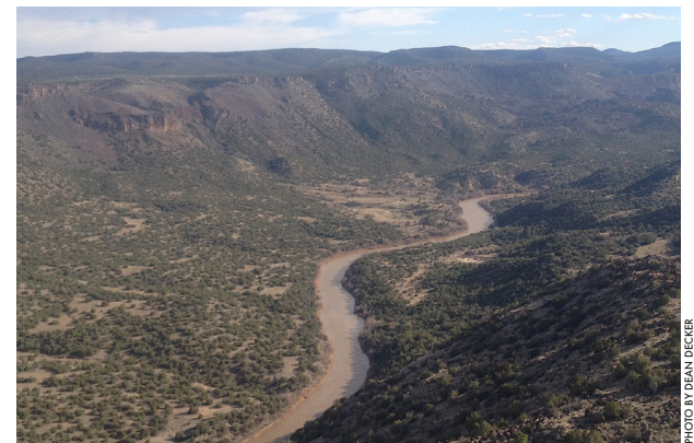
View of the Rio Grande from White Rock Overlook