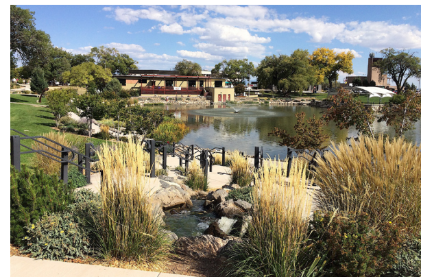
Ashley Pond Park

At 2.7 miles, on your left, is a replica of the 1940s Manhattan Project Main Gate.