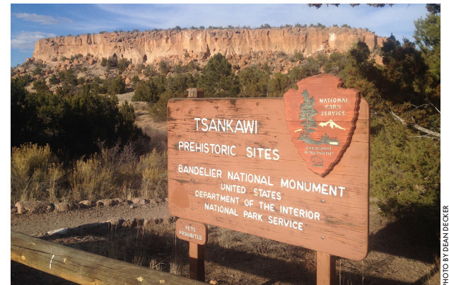
Path entering Tsankawi