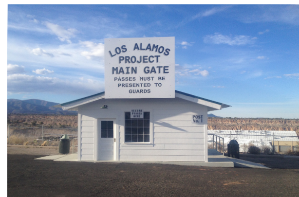
Manhattan Project Main Gate Replica