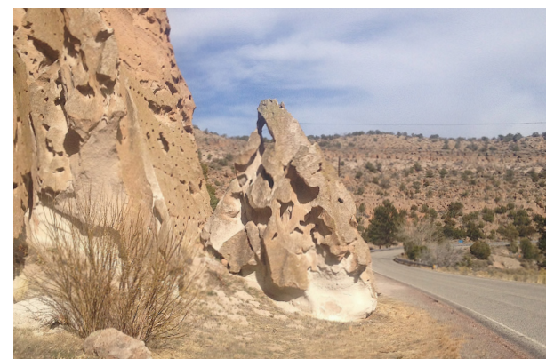
Cliff Rock Formations