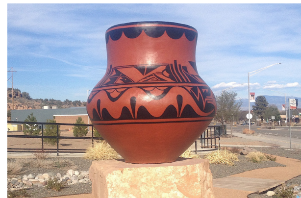
Large Pottery on NM Route 4