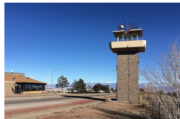
East Gate Guard Tower