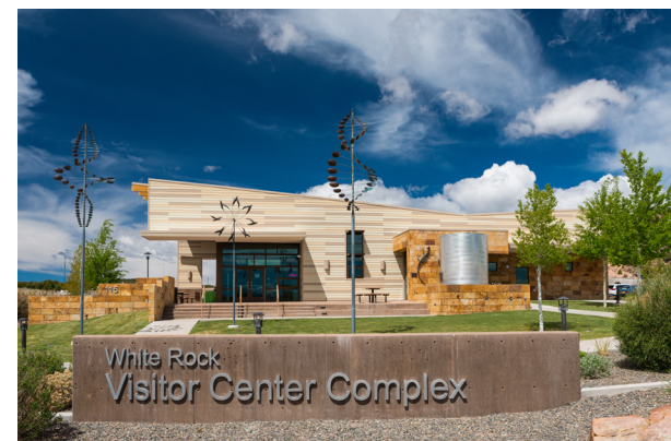
White Rock Visitor Center