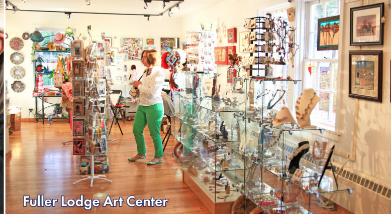
Fuller Lodge Art Center