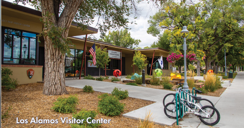
Los Alamos Visitor Center