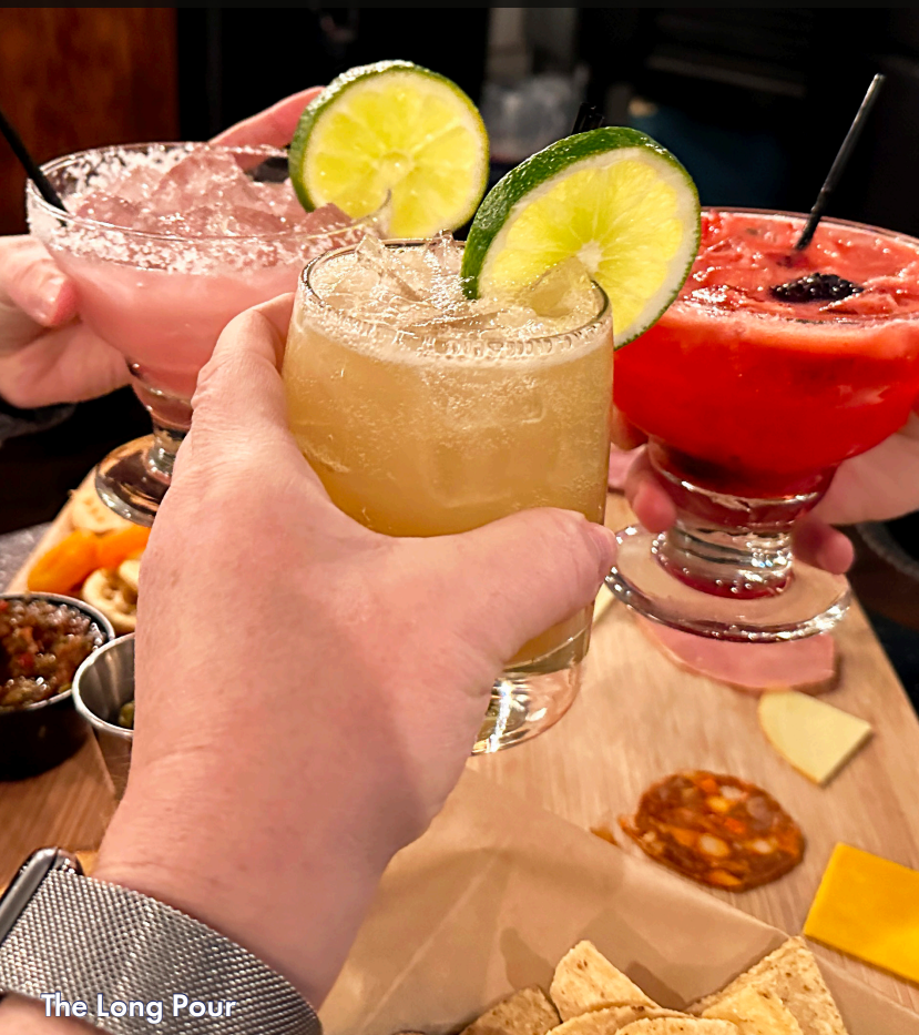
The Long Pour