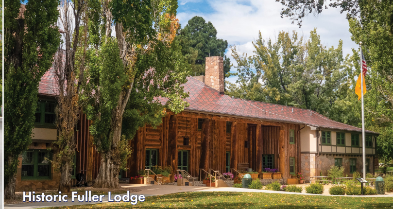
Historic Fuller Lodge