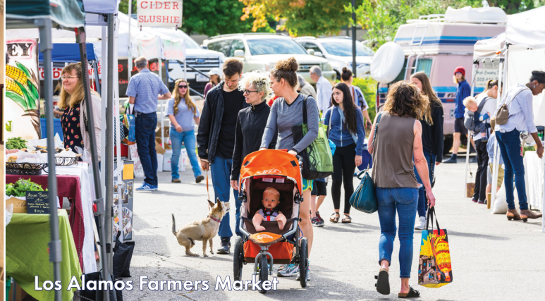
Los Alamos Farmers Market