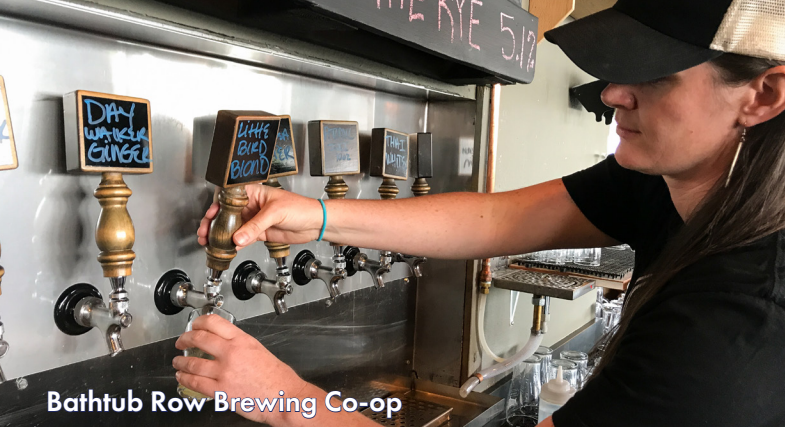
Bathtub Row Brewing Co-op