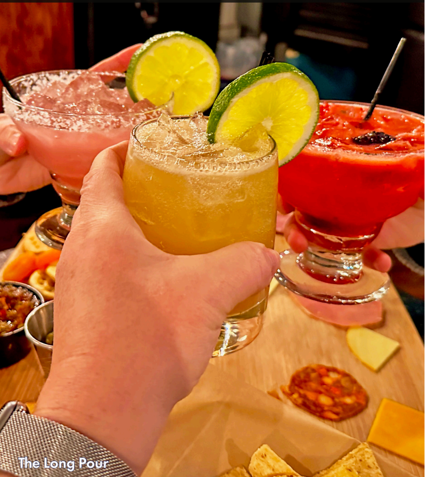
The Long Pour