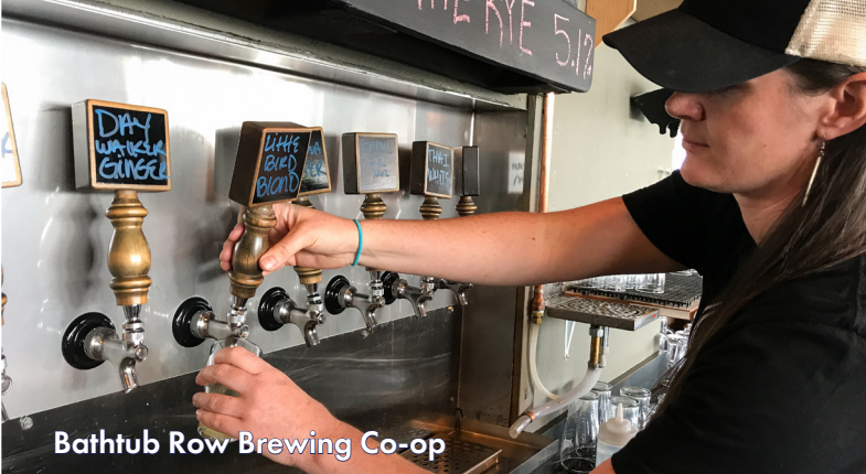
Bathub Row Brewing Co-op