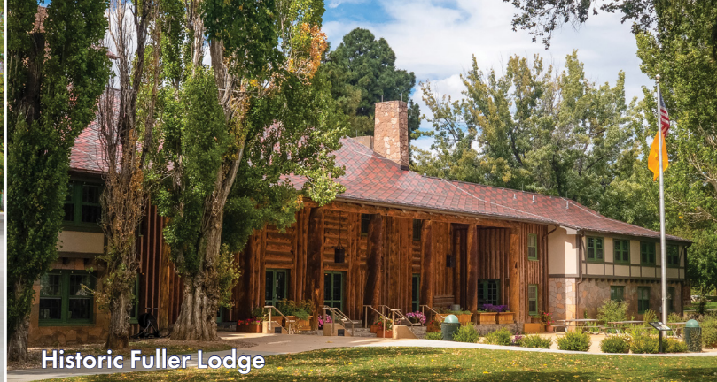
Historic Fuller Lodge