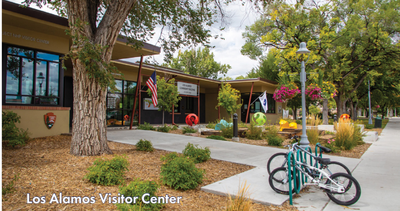
Los Alamos Visitor Center