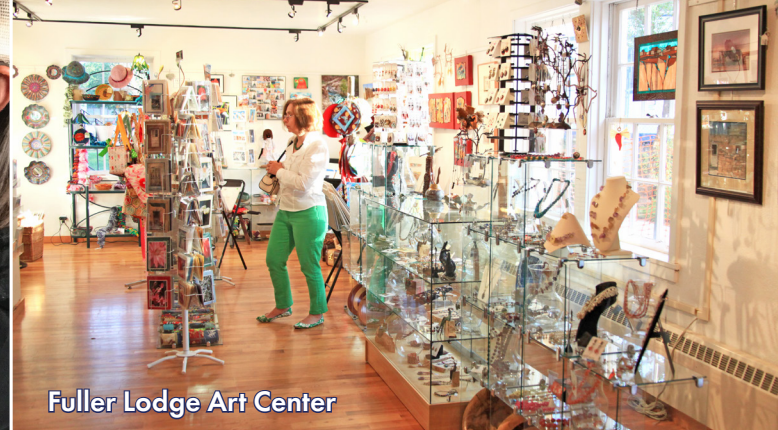
Fuller Lodge Art Center