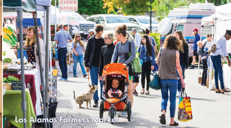
Los Alamos Farmers Market